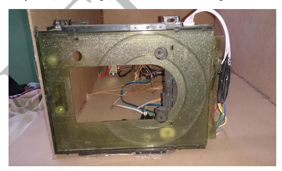
Figure 2 – close position of blind

The final state of our system takes place when the intensity of light drops below a certain value. This particular value is modeled to simulate darkness, and therefore the blinds rotate upward to a fully closed position (as shown in fig.2). This state is referred to as the night state.